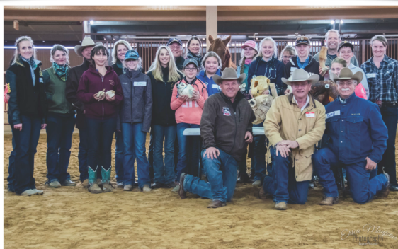
2017 CSU Ranch Sorting School Graduation Class