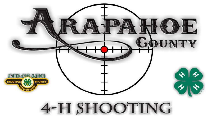
4-H SHOOTING SPORTS TEAM